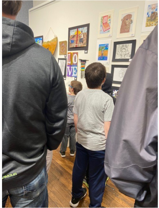
Students & parents viewing the “Young at Art” Exhibit.