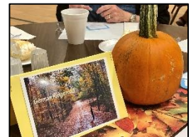
Table Decoration Give-Away: Attendees with a sticker under their chairs received a fall pumpkin table decoration.